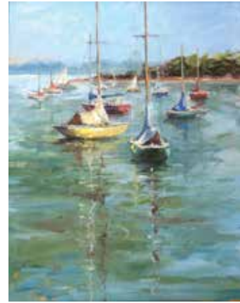
48. Nancy Haley Waiting for a Ride Oil, 20" x 16" $1,600