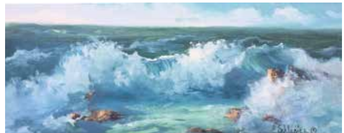
106. Grace Schlesier Playful Surf Oil, 6" x 18" $900