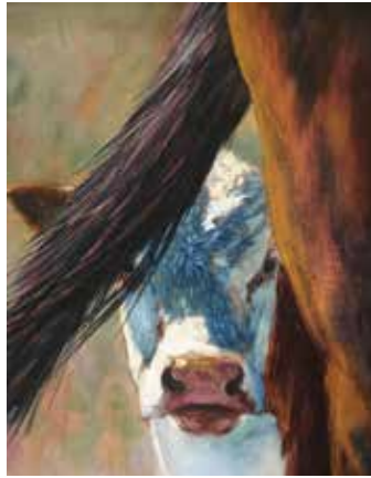
23. Gloria Chadwick Peekaboo Oil, 11" x 14" $800