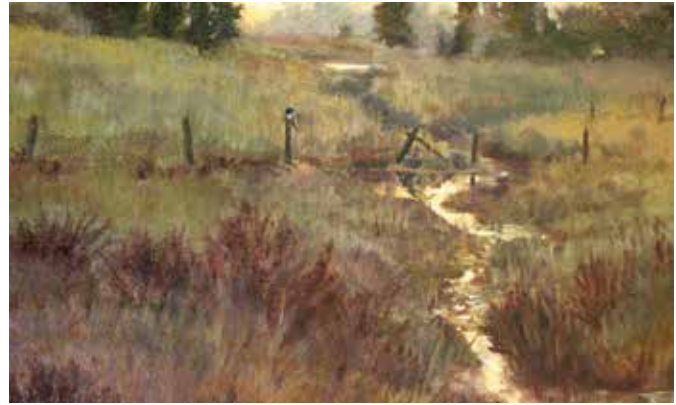
90. Carol Novotne Last Call Oil, 16" x 24" $1,200