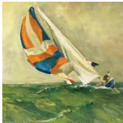
82. Kathryn McMahon, Signature Billowing Sails Oil, 20" x 20" $2,100