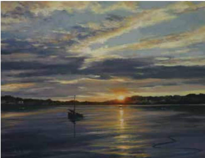
Paula Holtzclaw Master Signature Anchored In Oil, 12" x 16" $3,000

WAOW is an organization of professional women painters and sculptors