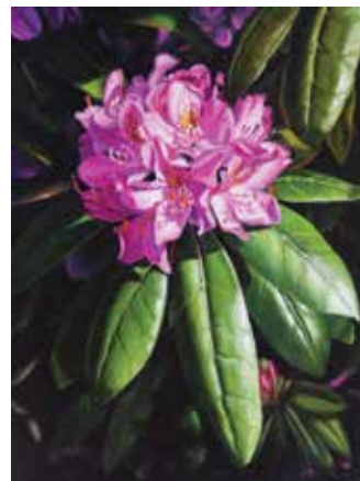
94. Jean Olliver Rhododendron Oil, 12" x 16" $900