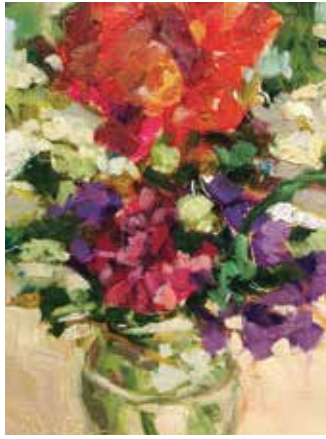
59. Melissa Jander Summer Gems Oil, 10" x 8" $325