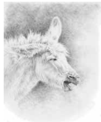
28. Donna Cox Irish Donkey Pencil, 14" x 11" $950