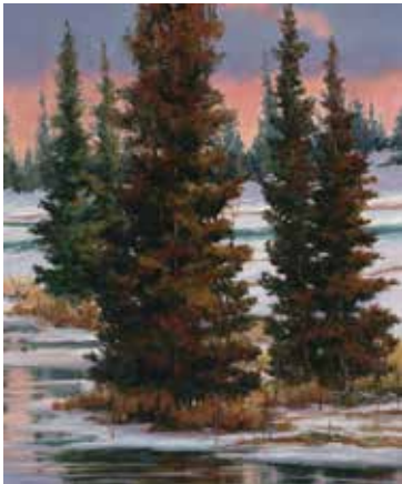
67. Sheryl Knight December Light Oil, 20" × 16" $1,950