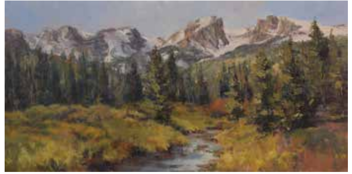
24. Jenifer Cline, Signature Winter Fades Oil, 12" x 24" $1,425