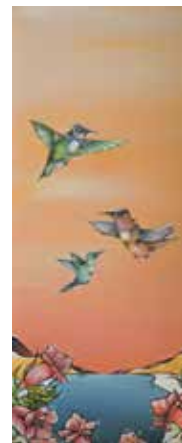
110. SJ. Shaffer Rhapsody Mixed Media, 20" x 9" $1,098