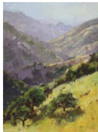
46. Joy Gonzalez California Foothills Oil, 16" x 12" $1,400