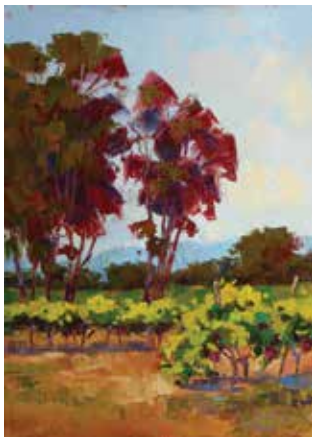
69. Linda Star Landon Somewhere Between Sonoma and Napa Oil, 16" × 12" $675