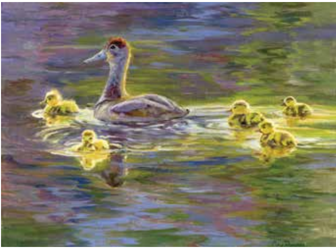
Cecy Turner Master Signature, Emeritus Marching to a Different Drummer Oil, 14" x 18" $1,300