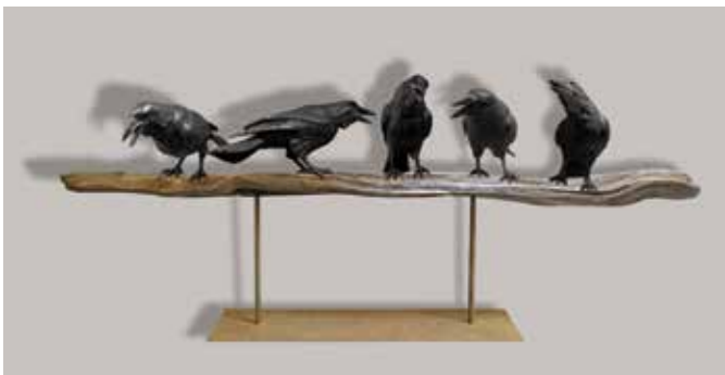
81. Deanne McKeown Chorus Line Bronze, 21" x 58" $8,250