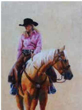
63. Sarah Kennedy, Signature Golden Glow Oil, 16" x 12" $850