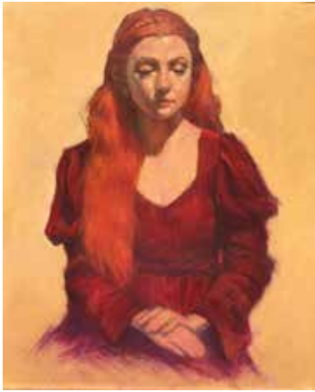
113. Andrea Stanley Ophelia Oil, 20" x 16" $1,400