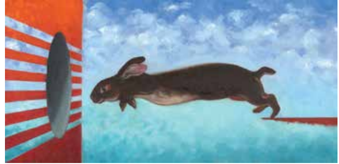
18. Lorraine Bushek Down the Rabbit Hole Oil, 10" x 18" $700