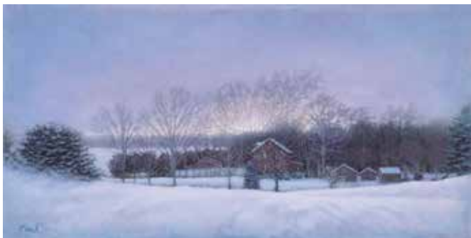
99. Nancy Peach, Signature The Hush of Morning Oil, 10" x 20" $2,000