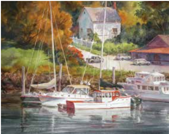
49. Nancy Harkins, Signature Camden Marina Watercolor, 13.5" x 16.5" $1,200