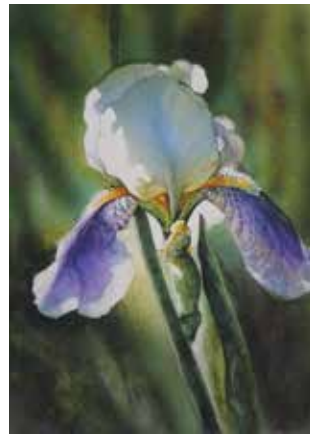
60. Linda Johnson Morning Glow Watercolor, 12" x 10" $800