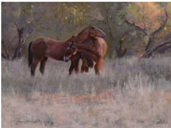
105. Nancy Romanovsky Gentle Morning Oil, 12" x 16" $800