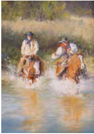
17. Pam Bunch The Crossing Oil, 12" x 9" $750