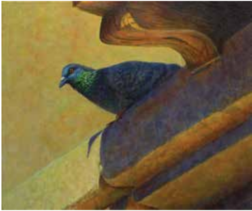
83. Kim Middleton , Signature Mission Dove Oil, 11" x 14" $1,300