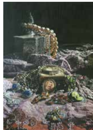
88. Eileen Nistler The Family Jewels Colored Pencil, 22" x 16" $4,000