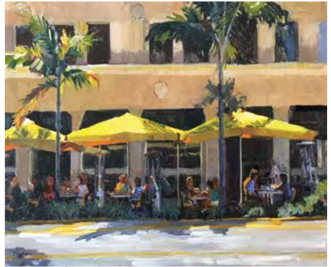
Heather Arenas Master Signature Naples Cafe Oil on cradled birch, 24" x 36" $4,200