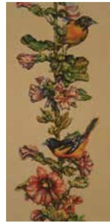
62. Carol Kelley, Signature Baltimore Orioles on Hollyhock Oil, 16" x 8" $695