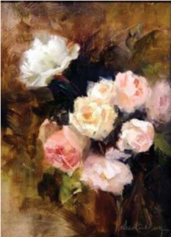
Dee Kirkham Master Signature Christine's Roses Oil, 9" x 12" $950