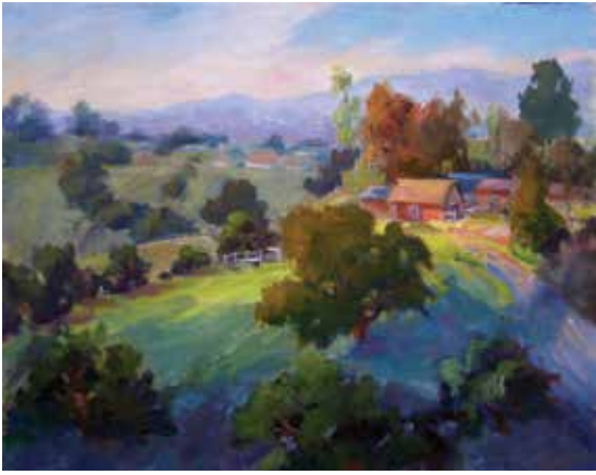
41. Eleanor Freudenstein , Signature The Valley Oil, 16" x 20" $3,000