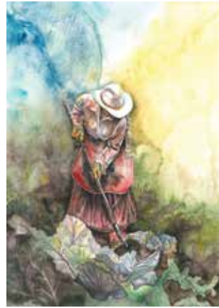
126. Kim Whitton Mama Nature Watercolor, 19" x 11" $1,500