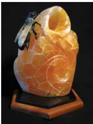
117. Kathryn Vinson Wild Honey Stone, 12" x 8" x 8" $3,000