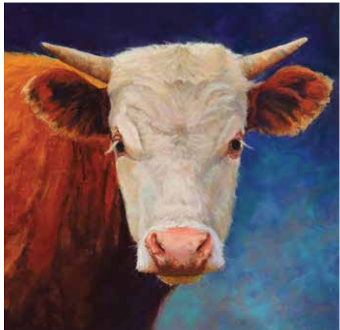
Addren Doss Master Signature Little Tex Pastel, 12" x 12" $750