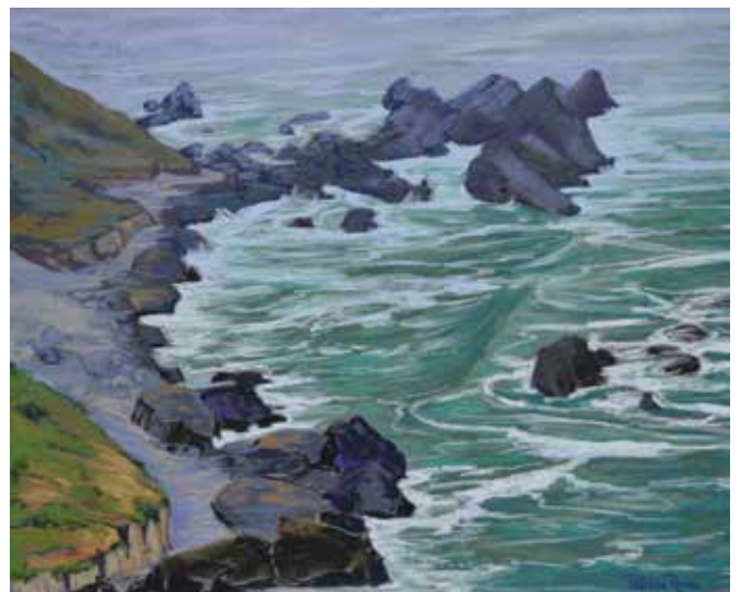
Patricia Rose Ford Master Signature Coastal Morning Solitude Pastel, 15" x 19" $2,000