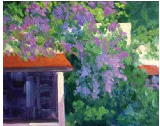
26. Jane Coulombe, Signature Burst of Spring Oil, 8" x 10" $800