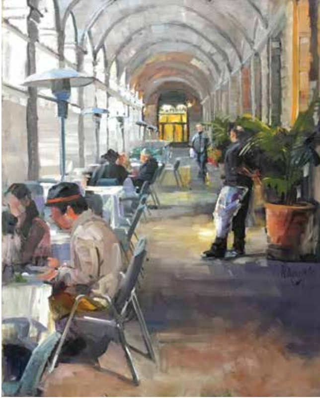
Heather Arenas Master Signature Glaciar en Barcelona Oil on cradled birch, 30" x 24" $4,000