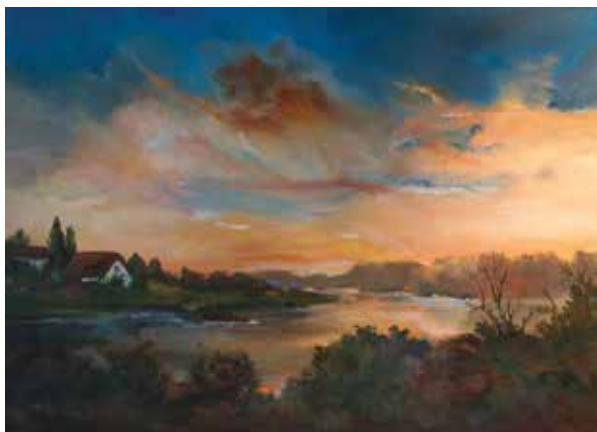
87. Dana Nash European Sunset Oil, 12" x 16" $1,200