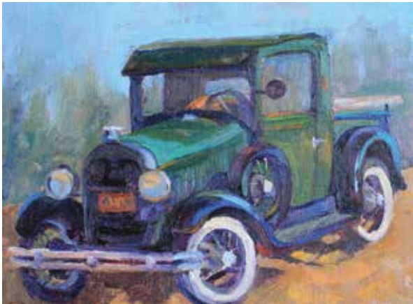
7. Tricia Bass Farm Truck Oil, 9" x 12" $600