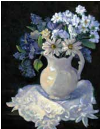
127. Barbara Kitty Williams Mother's Favorites Acrylic, 20" x 16" $2,500