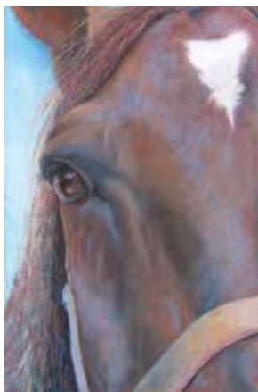
103. Mikaela Quinn Ready to Ride Pastel, 17" x 11" $700