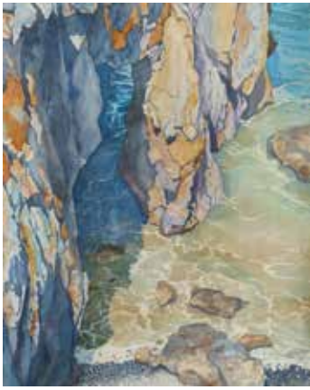
125. Leslie White Wild Cove Watercolor, 14" x 11" $850