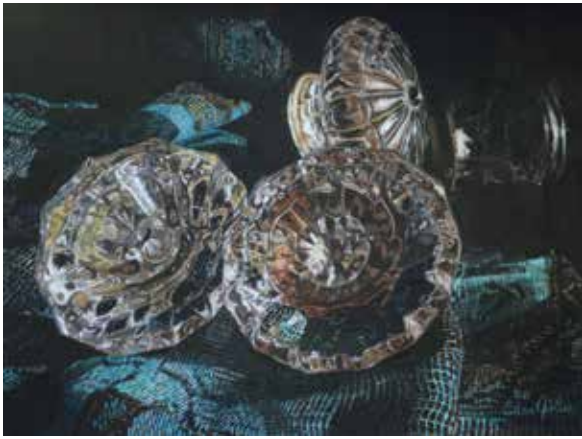
89. Eileen Nistler Aunt Clara's Collection Colored Pencil, 11" x 14" $1,800