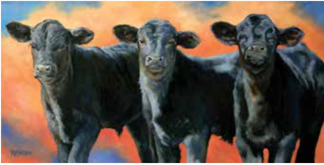
Mejo Okon Master Signature Choir Boys Oil, 12" x 24" $1,900