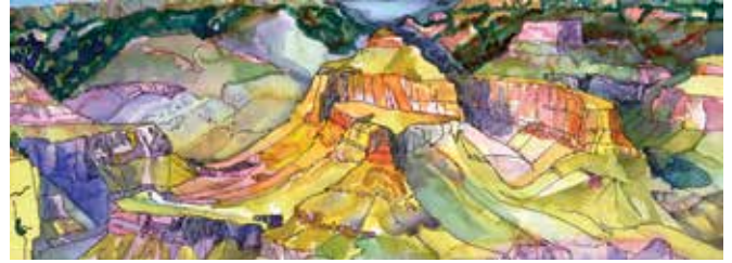
120. Risa Waldt Honor - South Rim, Grand Canyon Watercolor and Ink, 8" x 22" $975