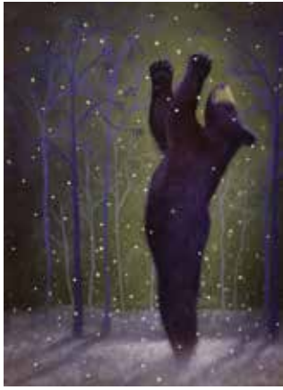
95. Nancy Oppenheimer Night Magic Oil, 14" x 18" $1,750