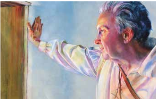
57. Jeanne Hyland, Signature Greeting the Day Watercolor, 15" x 22" $1,975