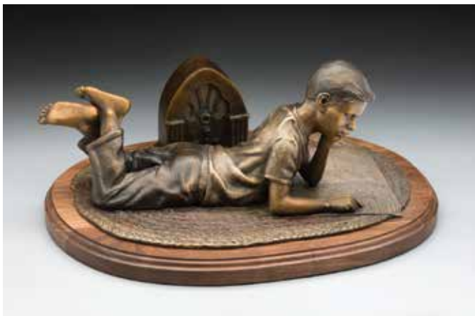
Lori Kiplinger Pandy Master Signature Sunday Comics Bronze, 12" x 18" x 6" $5,400

Please visit Women Artists of the West's website at www.waow.org