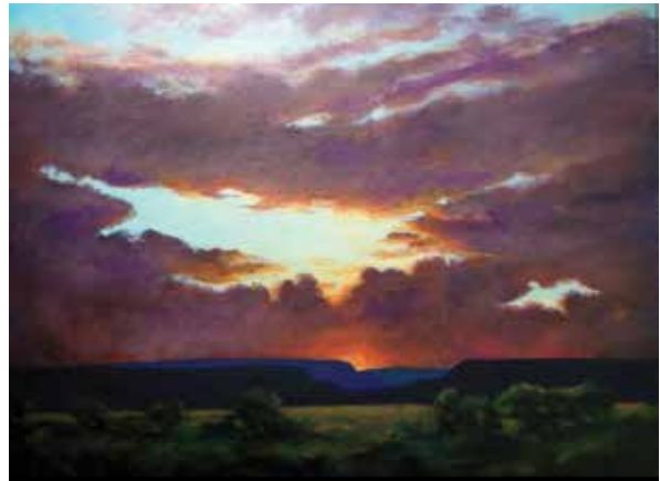
8. Carolyn C. Bell Southwest Sunset Acrylic, 12" x 16" $975