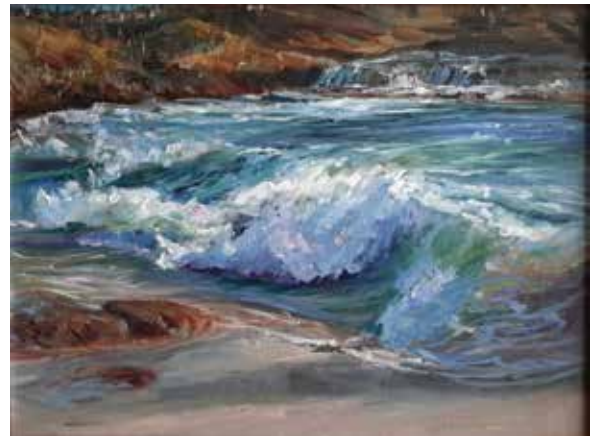
14. Liz Bonham Emerald Wave Oil, 12" x 16" $850