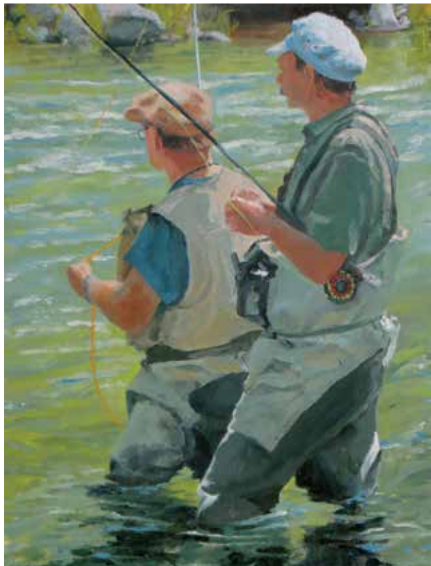
Ginger Whellock Master Signature Boys Will Be Boys Oil, 16" x 12" $1,400