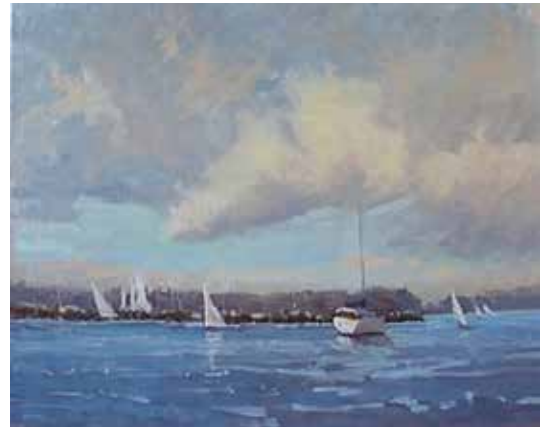
86. Suzanne Morris Sound Sail Oil, 16" x 20" $1,525