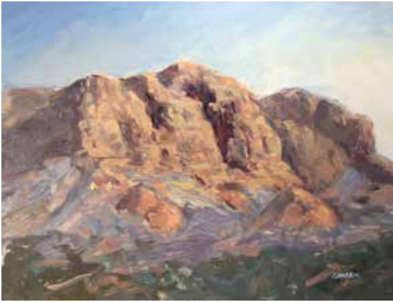
5. Kay Baker A Firm Foundation Oil, 11" x 14" $650