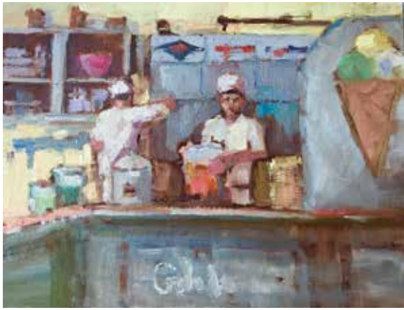
11. Donna Bland Gelato Chefs in Italy Oil, 12" x 16" $795