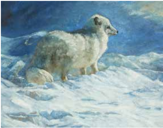
31. Patrice Dello-Russo Arctic Blues Oil, 11" x 14" $2,100