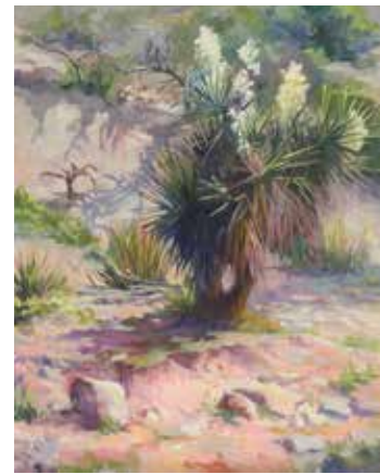
76. Barbara Mauldin Blooming Yucca Oil, 20" x 16" $1,100