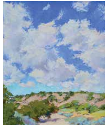
68. Cheryl Koen Over the Arroyo Oil, 16" × 22" $1,500