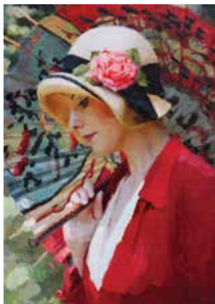
21. Victoria Castillo Dappled Light Oil, 11.5" x 8" $1,450