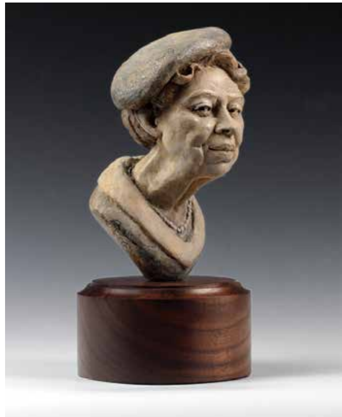
Lori Kiplinger Pandy Master Signature Eleanor Cast Stone, 7.5" x 5" x 6" $475