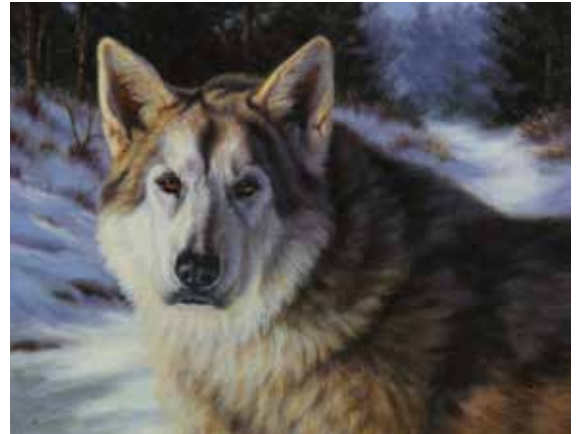
96. Peggy Bradshaw Palm Bijoux Oil, 16" x 20" $1,500