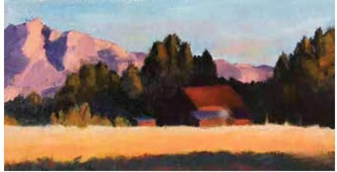
66. Kate Klingensmith Early Morning, Canon City Oil, 5.6" × 10.5" $450