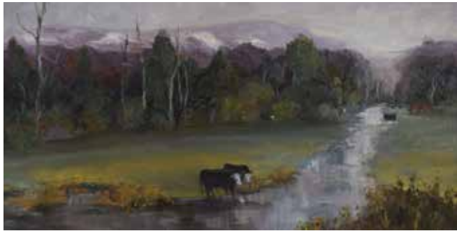
121. Nina Walker Last Call Oil, 10" x 24" $1,400