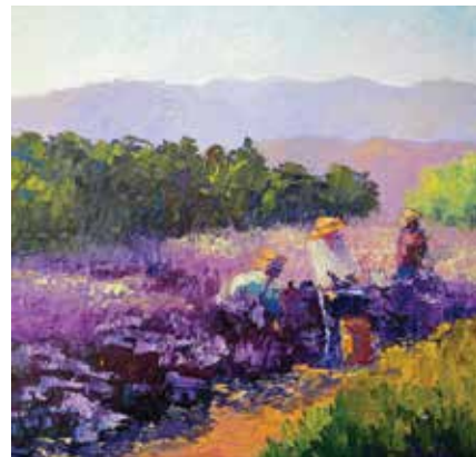
22. Terry Chacon Harvest Time Oil, 12" x 12" $1,500