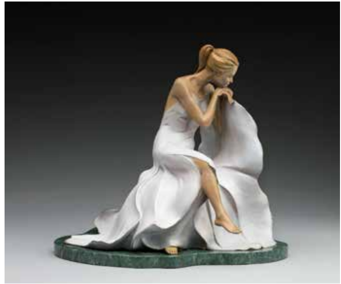
Phyllis deQuevedo Master Signature At First Light Bronze - Edition of 50, 12" x 12" x 16" $3,250