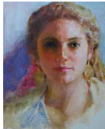
104. Carol Roberts Girl With the Gold Earrings Oil, 14" x 11" $595