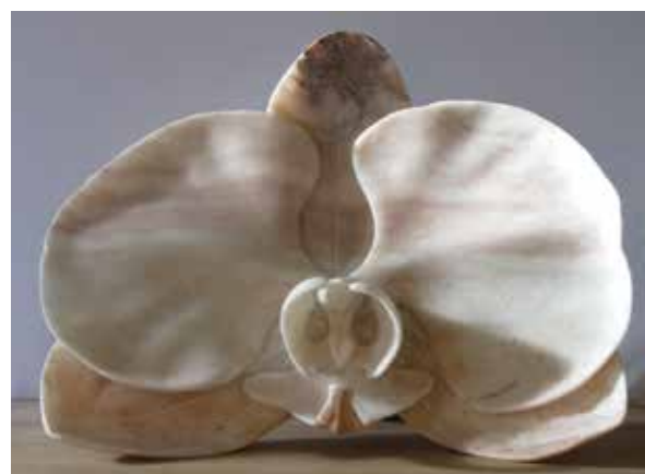
118. Kathryn Vinson Alabaster Orchid Stone, 10" x 12" $3,500