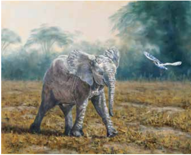
Christine Drewyer Master Signature Playmates Oil on linen, 16" x 20" $2,600