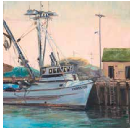
20. Valerie Carson, Signature Endeavor Oil, 12" x 12" $950