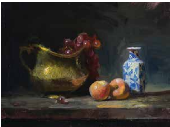
39. Kelli Folsom Brass and Blue Oil, 11" x 14" $1,500