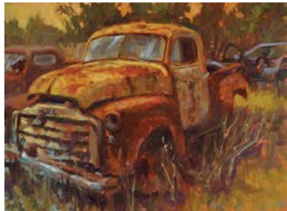
10. Bruce Bingham Texas Gold Oil, 12" x 16" $1,500