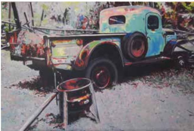
93. Pat O'Brian Abandoned Oil, 16" x 24" $1,500