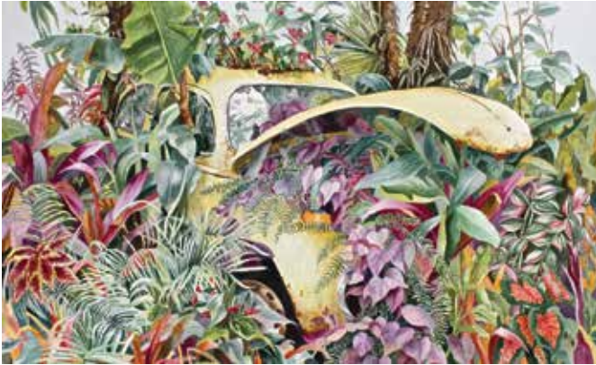
73. Tricia H. Love, Signature A Bug in the Garden Watercolor, 15" x 23.5" $1,200