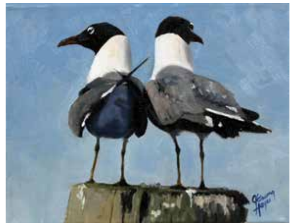
52. Julie Gowing Hayes, Signature Beach Patrol Oil, 8" x 10" $450