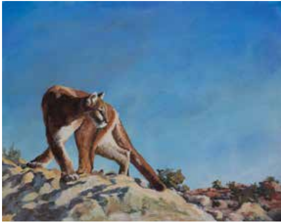
19. Nancee Busse High Desert Puma Acrylic, 16" x 20" $1,200