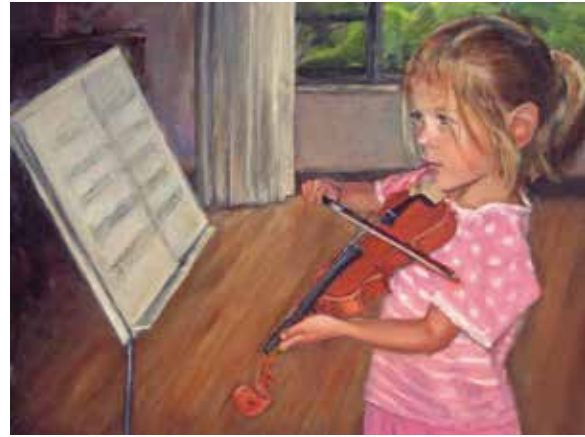
114. Kazuko Stern, Signature Little Violinist Oil, 11" x 14" $550