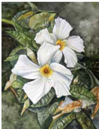
3. Jean Apgar At the Greenhouse Watercolor, 14" x 10.25" $350