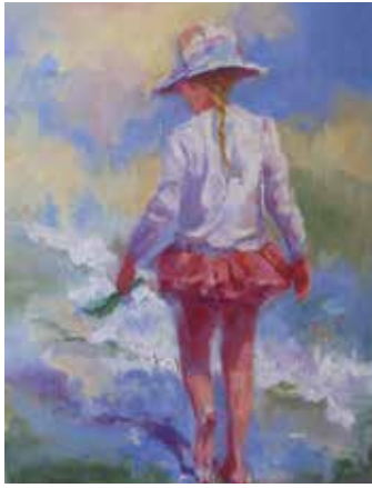
29. Janelle Cox New Adventures Oil, 16" x 12" $925