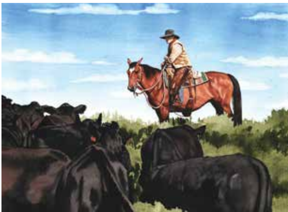
27. Amanda Cowan Counting Through the Gate Watercolor, 9" x 12" $864