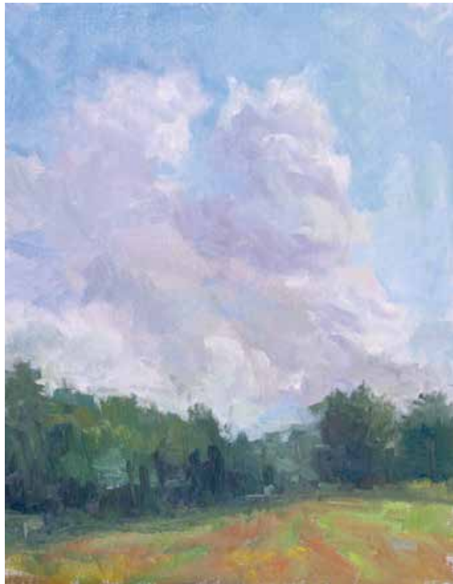
Amy Evans Master Signature, Emeritus Summer Sky Oil, 14" x 11" $725