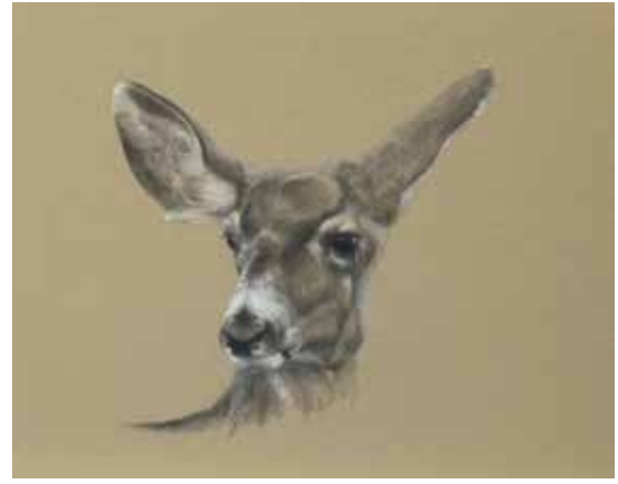
72. Skeeter Leard Grace Pencil/Pastel, 10.25" x 11" $475