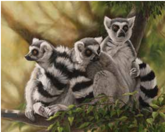
97. Mary Lou Pape Homeland Security Oil, 16" x 20" $2,200