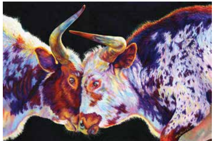
Sharon Markwardt Master Signature Eye to Eye Oil, 24" x 36" $4,875