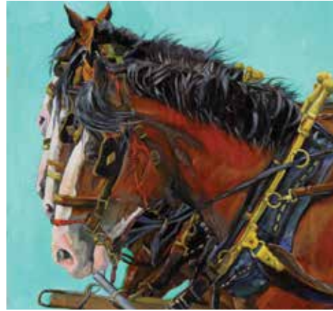
42. Sally Fuess , Signature Four in Hand Oil, 20" x 20" $1,400