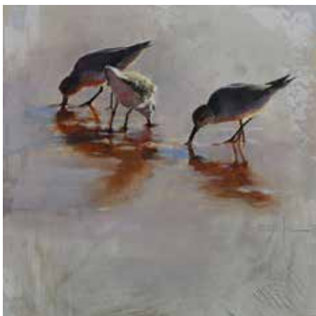
45. Ann Goble , Signature Reflections in Red Oil, 12" x 12" $700