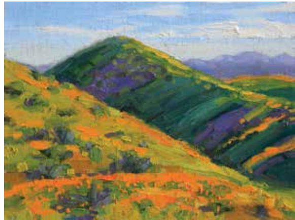
128. Esther Williams Poppy Hills of Walker Canyon Oil, 6" x 8" $400