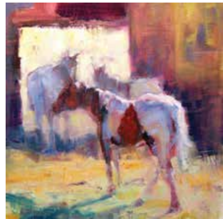
124. Shirle Wempner Just Chill'n Oil, 12" x 12" $950