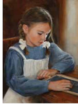
36. Cynthia Feustel School Days Oil, 12" x 9" $1,150