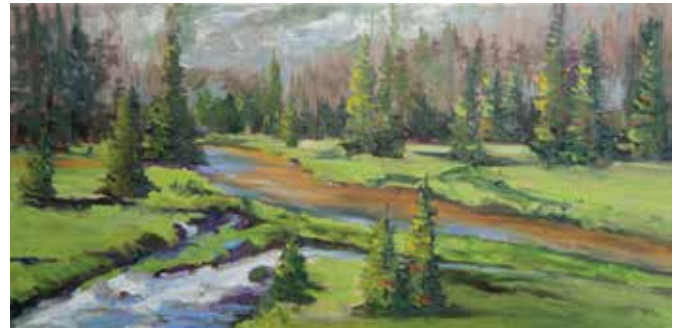
32. Diane Edwards Rusty Creek Oil, 12" x 24" $800