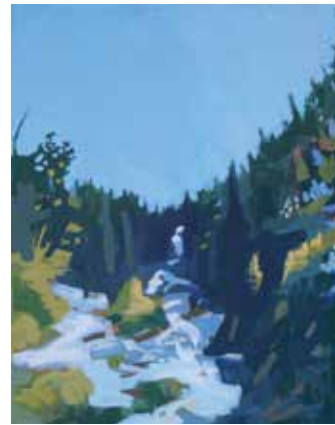
56. Shelley Hull, Signature Fish Creek Falls Acrylic, 14" x 11" $325