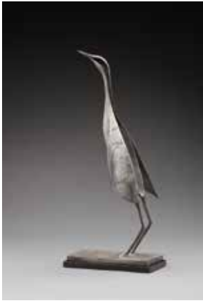
77. Georgene McGonagle What's Up? Bronze, 16" x 7" x 4" $1,700