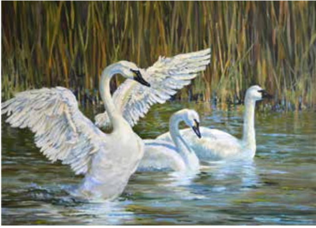
Mary Ann Cherry Master Signature, Emeritus Tundra Swans at Market Lake Oil, 24" x 29.75" $4,200