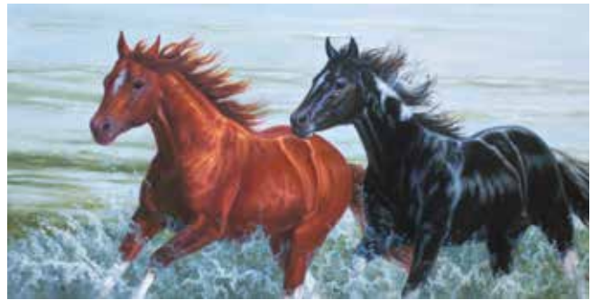
70. C. J. Latta River Romp Acrylic, 12" × 24" $1,650