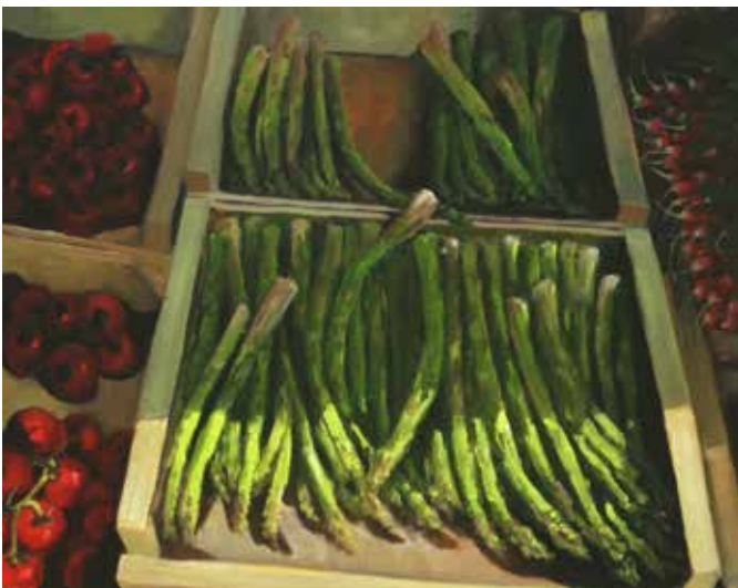
Ginger Whellock Master Signature Spring Market Oil, 11" x 14" $1,100