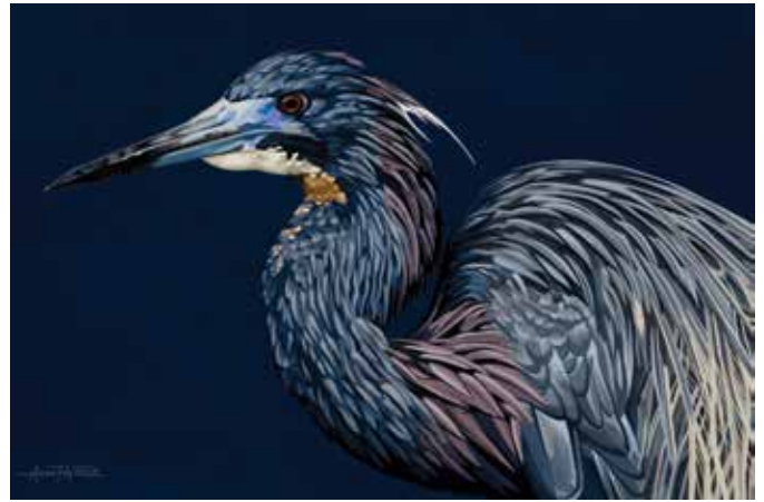
Anne Peyton Master Signature Bayou Beauty Acrylic, 12" x 18" $2,500