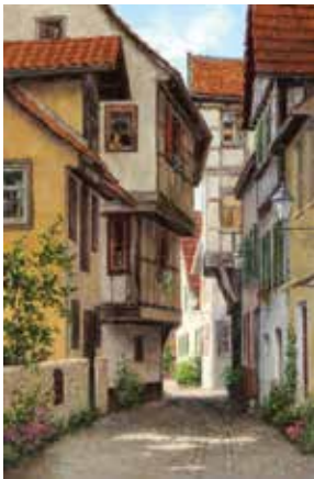
91. Barbara Nuss Yesterday's Shadows Oil, 24" x 16" $2,600