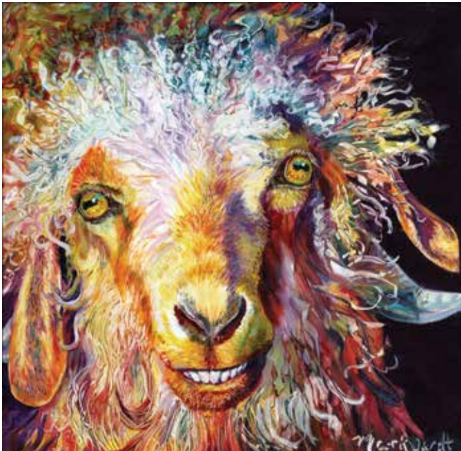
Sharon Markwardt Master Signature Goat Cheese Oil, 12" x 12" $1,000