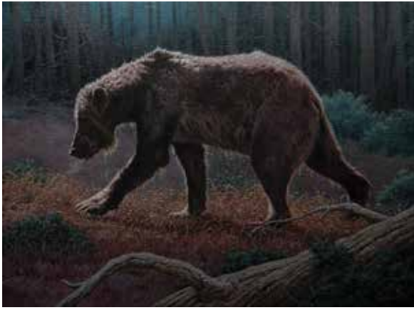
107. Elizabeth Lewis Scott Grizzly Bling Oil, 9" x 12" $1,400