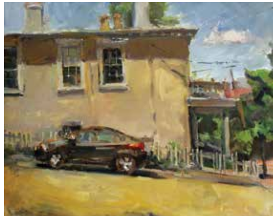
6. Jill Banks Better Days Oil, 16" x 20" $2,150