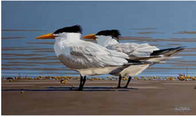
Anne Peyton Master Signature Beach Boys Acrylic, 12" x 20" $2,600