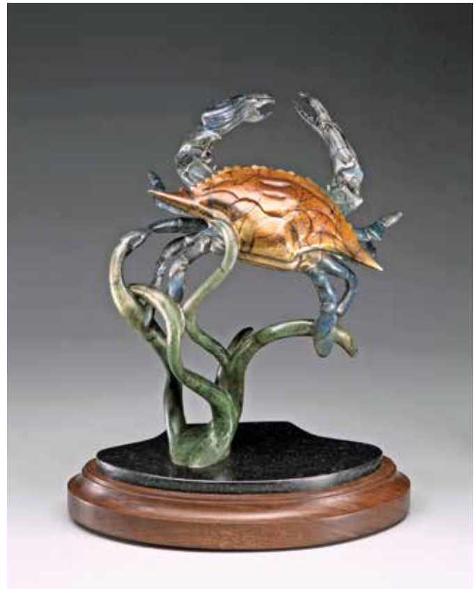
Kim Shaklee Master Signature Ascent Bronze - Edition of 30 14-1/2" x 11-1/2" x 8-1/2" $3,850