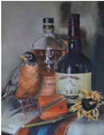
55. Debbie Hughbanks, Signature Redbreast Pastel, 14" x 10" $1,200