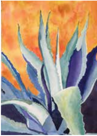
53. Margie Hildreth Agave Watercolor, 20" x 14" $850