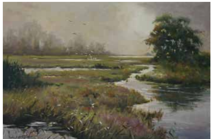
Paula Holtzclaw Master Signature Oak Island Morning Oil, 12" x 16" $3,400