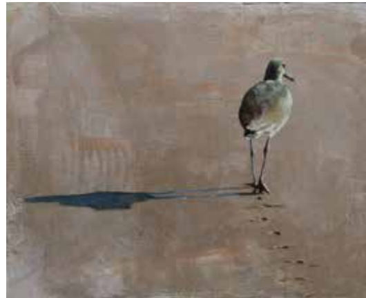
44. Ann Goble , Signature Cinnamon Beach Oil, 8" x 10" $700