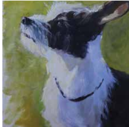
102. Lyn Hope Phariss, Signature Good Old Boy Oil, 10" x 10" $575