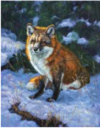
65. Leslie Kirchner Thoughts of Spring Oil, 20" × 16" $3,500