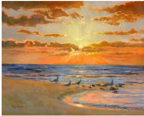
Cecy Turner Master Signature, Emeritus Dawn Gathering Oil, 16" x 20" $1,600