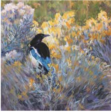
35. Kathryn Fehlig Magpie in the Rabbit Brush Acrylic, 18" x 18" $1,300