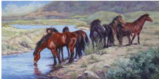
13. Yvonne Bonacci , Signature The Thirsty Bunch Oil, 12" x 24" $2,100