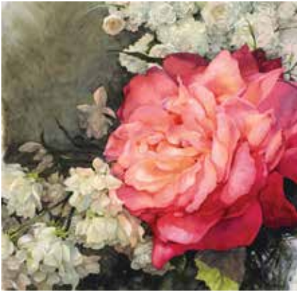
79. Laurel Lake McGuire In the Spotlight Watercolor, 17" x 17" $589