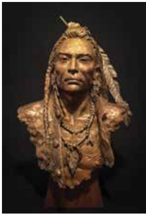
61. Heather Kaiser Aketcheta Warrior Bronze, 21" x 13" x 10" $5,100