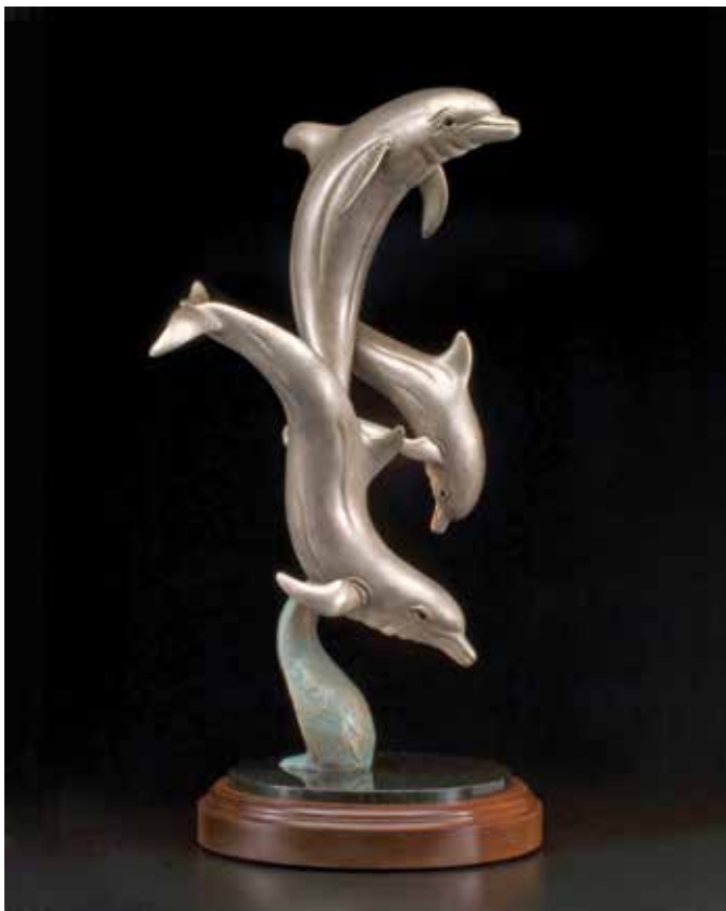
Kim Shaklee Master Signature Party Wave! Bronze - Edition of 20 24" x 13" x 11" $4,500