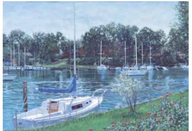
98. Nancy Peach, Signature Sheltered Cove Oil, 14" x 20" $2,600