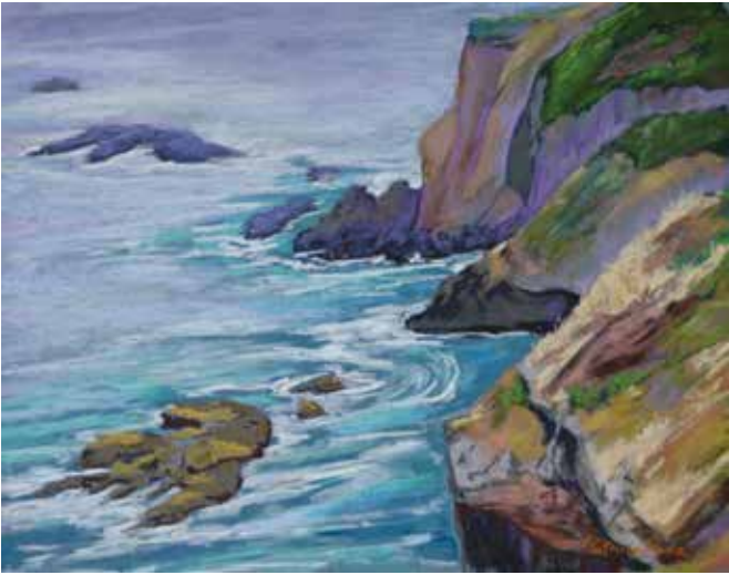
Patricia Rose Ford Master Signature Coastal Morning Escape Pastel, 14" x 18" $1,800