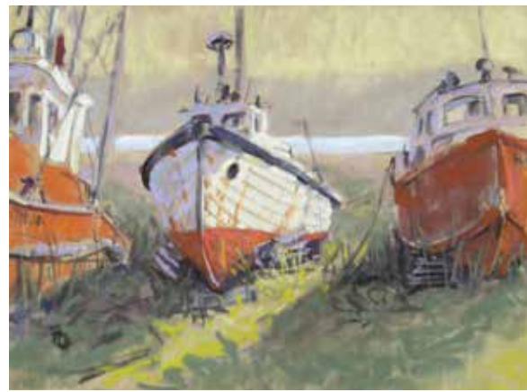
116. Virginia Unsel Old Friends Pastel, 9" x 12" $600