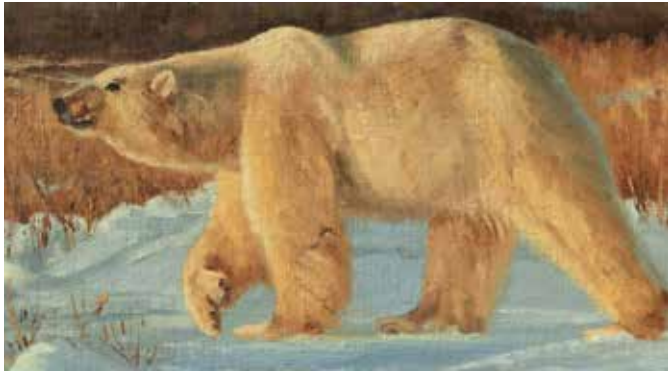
47. Diane Greenwood Arctic Spirit Oil, 12" x 16" $1,200