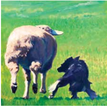
101. Dena Peterson, Signature The Chase Oil, 16" x 16" $1,000