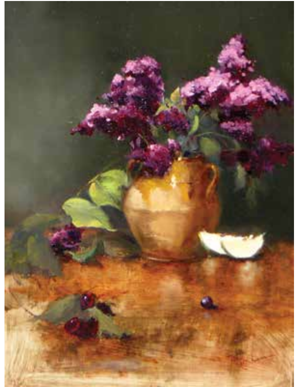
Dee Kirkham Master Signature Lilacs Oil, 16" x 20" $1,450