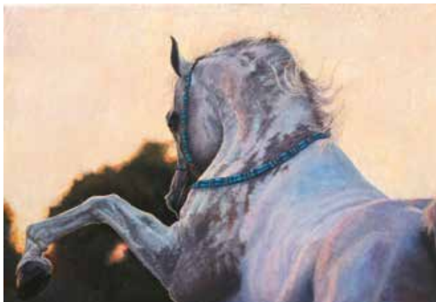
109. Naomi Shachar Turquoise Oil, 12" x 18" $2,600