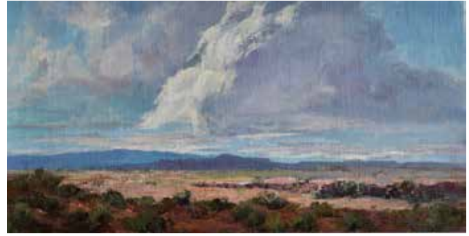
30. Jan DeLipsey Desert Cotton Oil, 10" x 20" $1,100