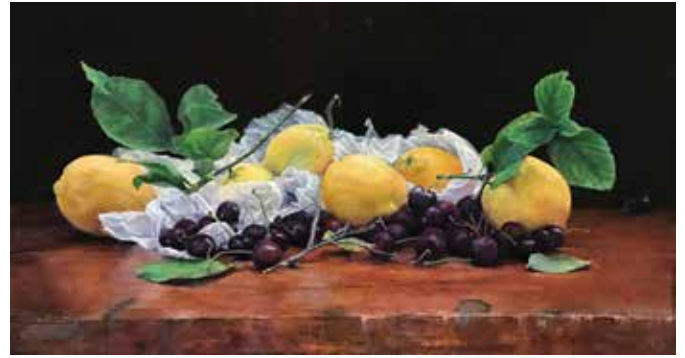
108. Naomi Shachar Unwrapped Oil, 14" x 26" $4,400