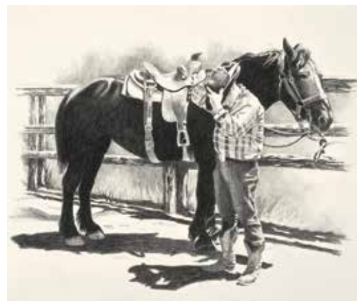
58. Doreen Irwin Another Day Pencil, 18" x 21" $1,900