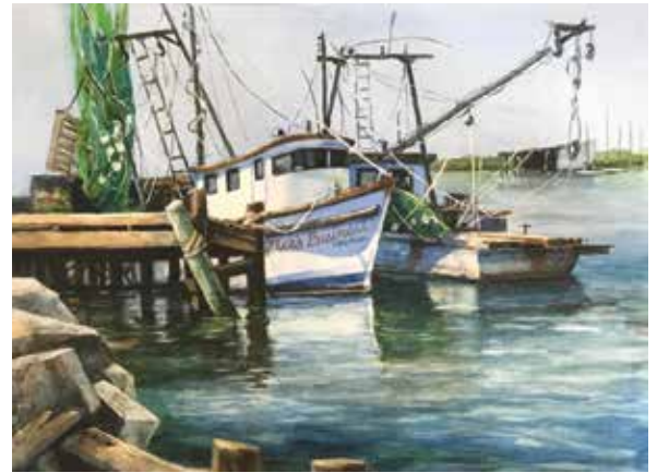
12. Tina Bohlman , Signature My Brother's Business Watercolor, 12" x 16" $1,000