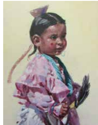
122. Carlene Wallace Tiny Dancer Oil, 14" x 11" $625