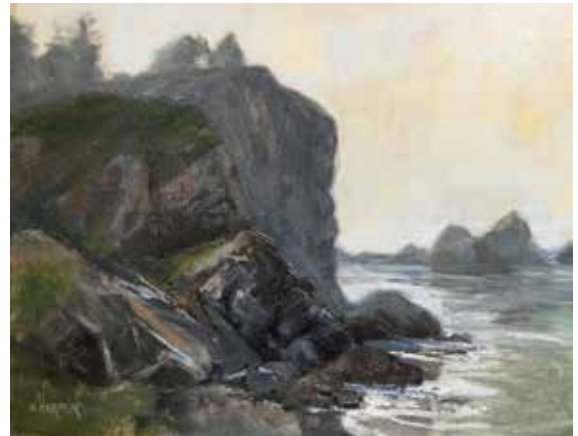
50. Nita Harper Swimming in the Fog Oil, 11" x 14" $1,600