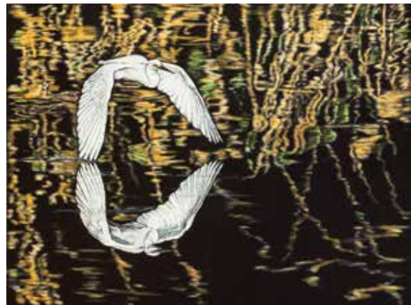
34. Judy Fairley, Signature Egret Reflection Scratchboard, 12" x 16" $1,100