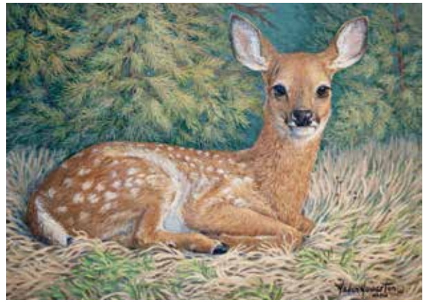
54. Helen Howerton, Signature A Place to Rest Acrylic, 16" x 20" $2,400