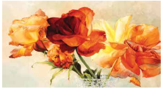
78. Laurel Lake McGuire In the Glow Watercolor, 12" x 22" $695