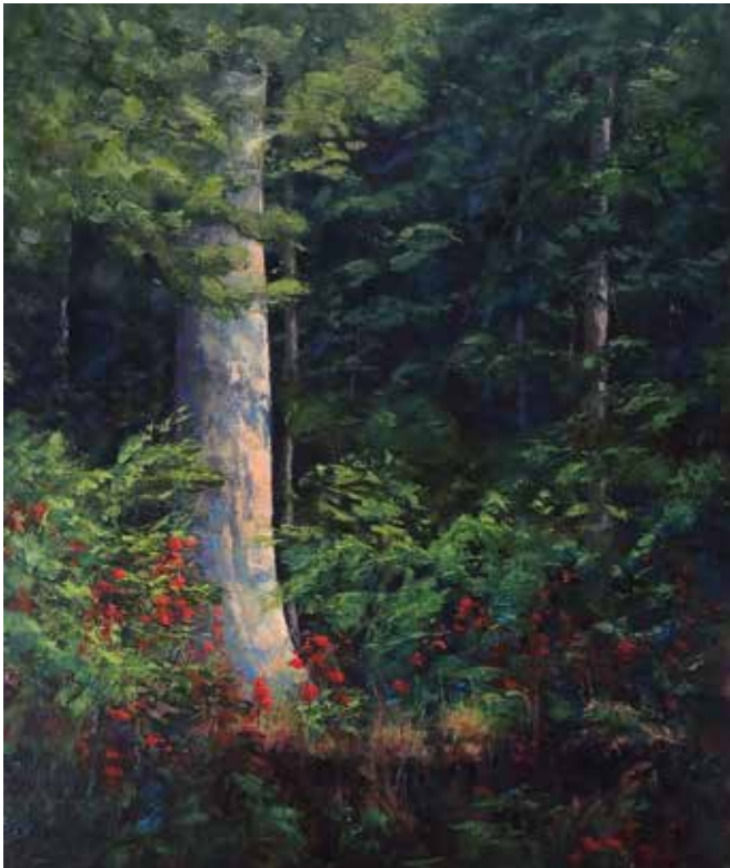
Addren Doss Master Signature Edge of the Forest Oil on linen panel, 24" x 20" $1,900