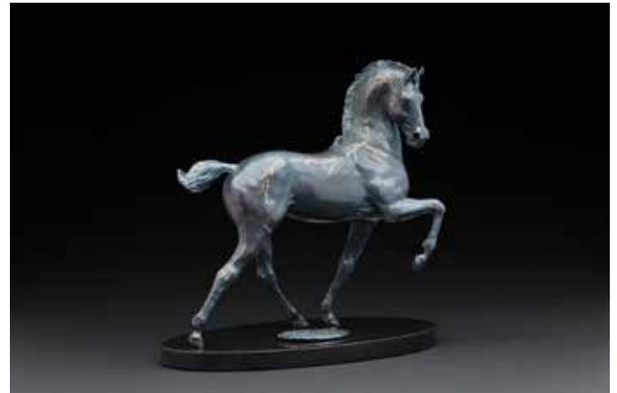
74. Janel Maher Seize the Day Bronze, 13.5" x 13.5" x 7.5" $2,875