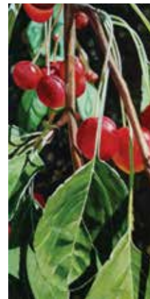
100. Cathy Pearson Heart of a Crab Apple Tree Acrylic, 24" x 12" $1,700