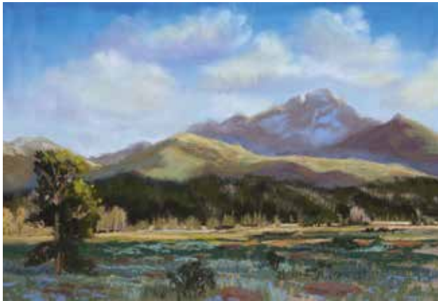
25. Heather Coen Long's Light Pastel, 11" x 14" $650