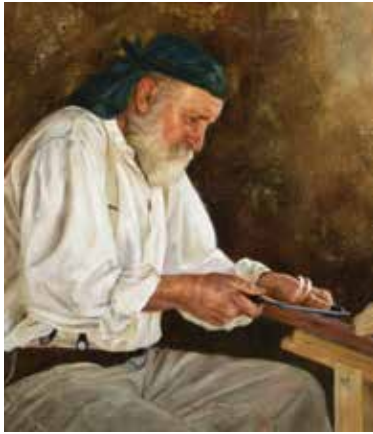
37. Cynthia Feustel The Woodworker Oil, 16" x 14" $1,800