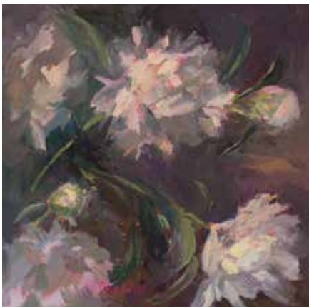
129. Sue Wipf, Signature Afternoon Light on Peonies Oil, 8" x 8" $450