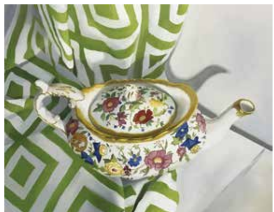
4. Suzanne Aulds Lena's Teapot Oil, 16" x 20" $500