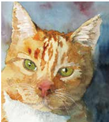
9. Ally Benbrook Mine, All Mine Watercolor, 9" x 8" $500