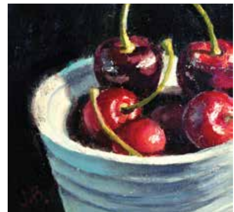
16. Janet Broussard Cherries in White Oil, 5" x 5" $325