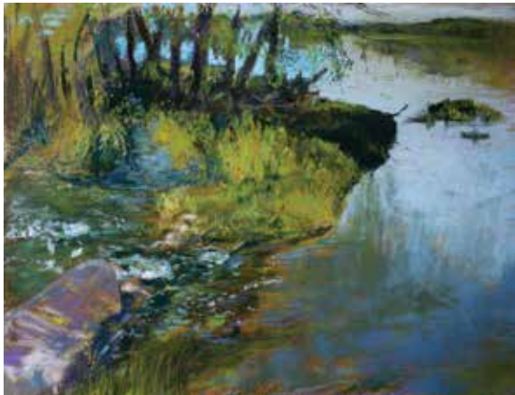
115. Nori Thorne Violette's Lock Pastel, 16" x 24" $1,000