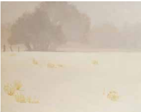
75. Susan Matteson Snow Fog Oil, 16" x 20" $2,200