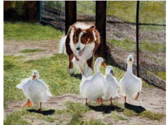
38. Robbie Fitzpatrick Gentle Persuasion Watercolor, 18" x 22" $3,500