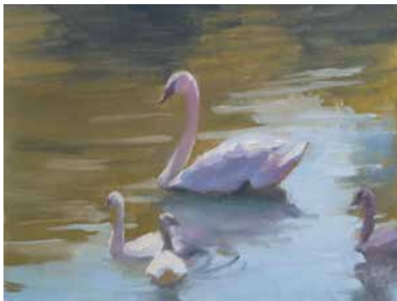
33. Shirley Fachilla Study for Role Model Oil, 8" x 10" $425