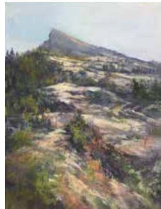
130. Janice Wright Aspen Peak Acrylic, 14" x 11" $825