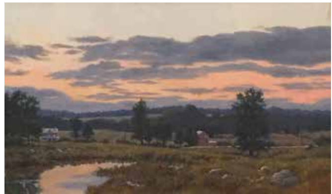
92. Barbara Nuss Miller's Pond Oil, 16" x 24" $2,600