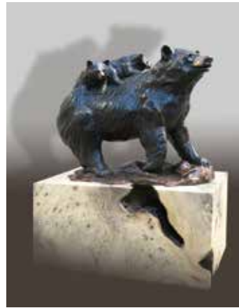
80. Deanne McKeown Bearback Riders Bronze, 9.5" x 13" x 6.1" $1,800