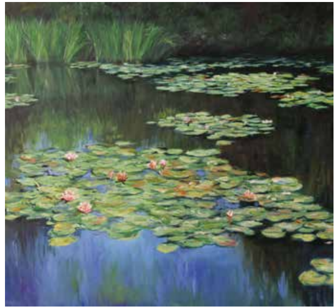
Mejo Okon Master Signature Afternoon Oil, 24" x 24" $2,300

Please visit Women Artists of the West's website at www.waow.org