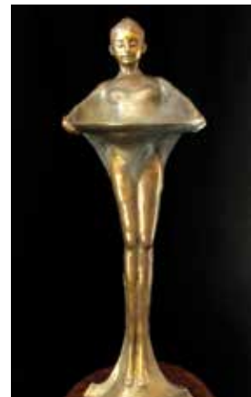
2. Kathy Anderson , Signature La Belle Bronze, 25" x 10" x 12" $1,850