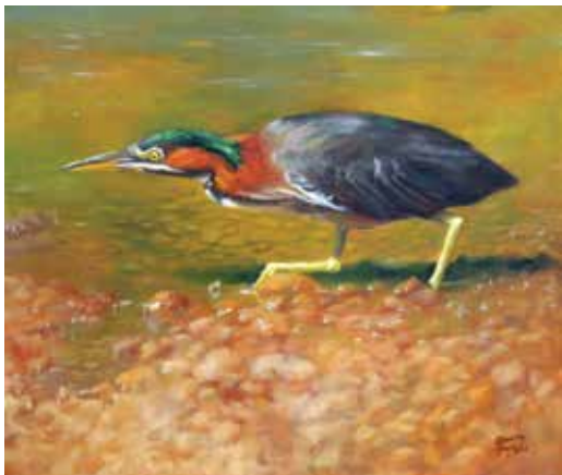
51. Julie Gowing Hayes, Signature Stalking the Shallows Oil, 16" x 20" $1,300