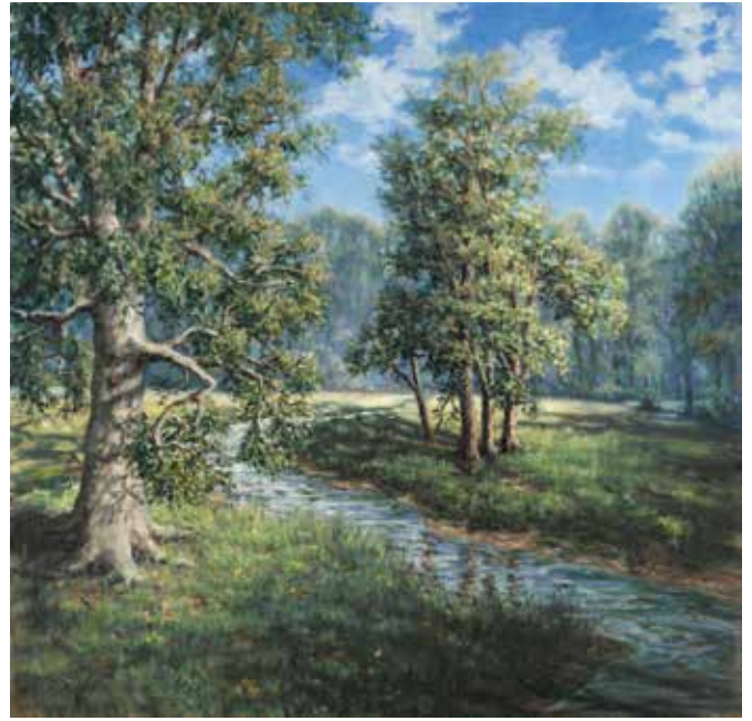
Christine Drewyer Master Signature Meander Oil, 30" x 30" $6,000