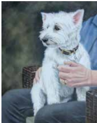
123. Linda Wells Lap Dog Oil, 14" x 11" $800